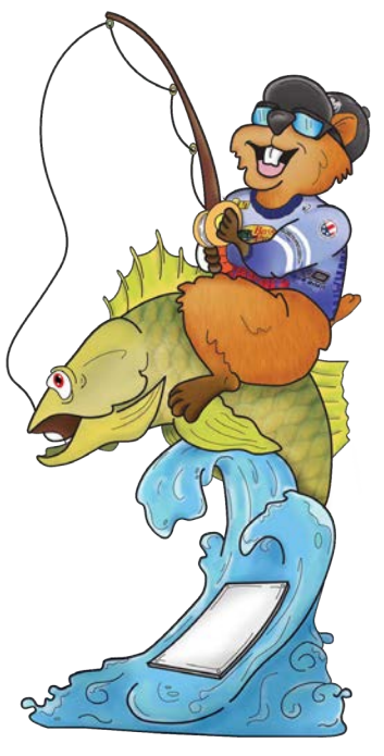
Dunkirk Dave the Groundhog is reeling in a monster Walleye in Dunkirk on Lake Erie

The recent National Walleye Tournament championships held in Dunkirk in August demonstrated that Walleye fishing is big business on a national level. Professional anglers on the tour brought their families with them, as they looked for interesting things to see and do during the day.