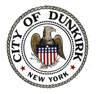
Wilfred Rosas, Mayor of the City of Dunkirk