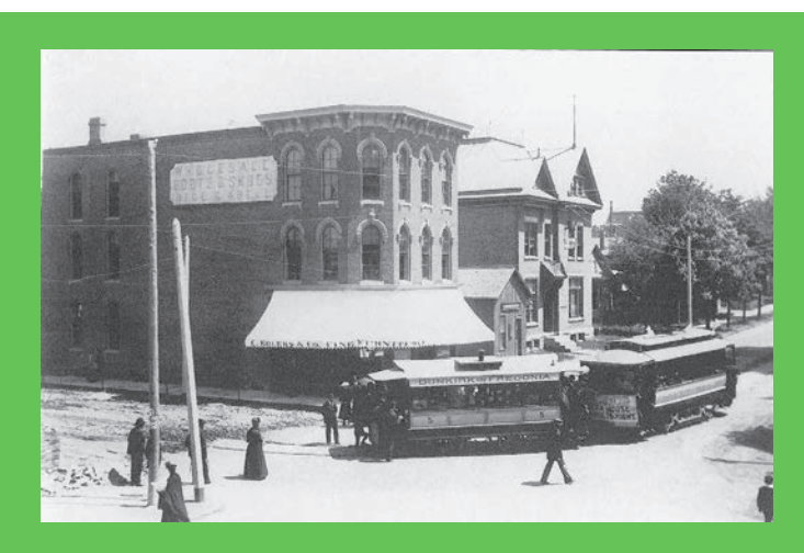
400-402 Central Avenue in 1892 (above) and a conceptual rendering for an adaptive reuse (below) redevelopment. The Chautauqua County Land Bank has site control and is working with City of Dunkirk to select a developer for a mixed use project that would include upper story residential units.